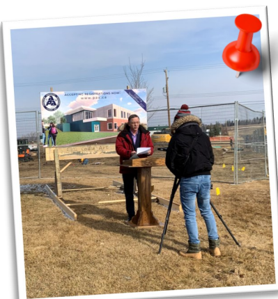
At the virtual ground breaking ceremony, representatives from all stakeholders, including the MLA and Mayor were present to help celebrate this historic event. Check out our website to see the video!