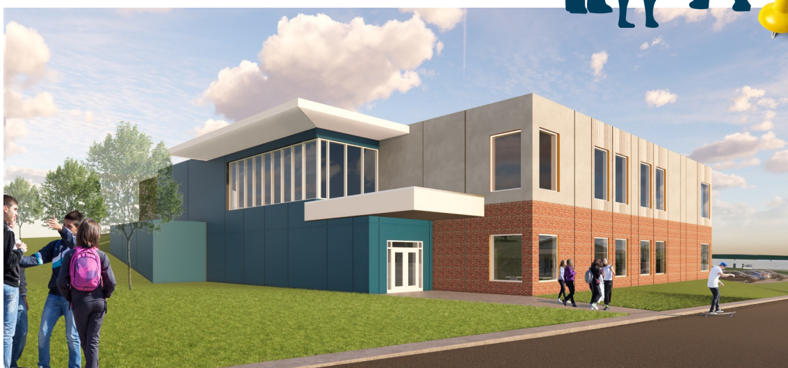
Rendering of the Proposed New Parkview Adventist Academy Home created by Eagle Builders. More information at www.paa.ca/new-building